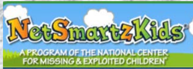
NetSmartz Kids Activities