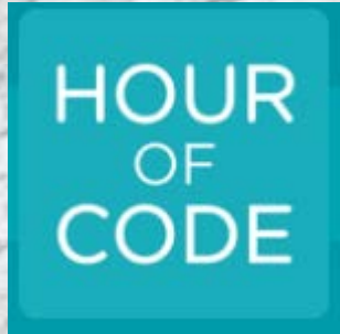
Hour of Code