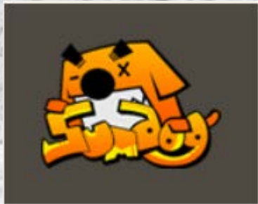
SumDog (4 th and 5 th Grade only)