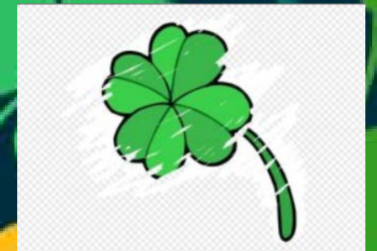
Reveal the Picture