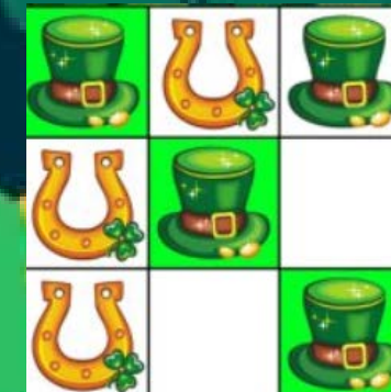
Tic Tac Toe