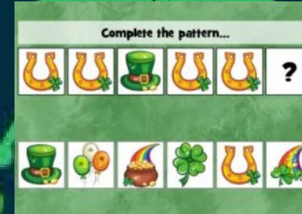
Complete the Patterns