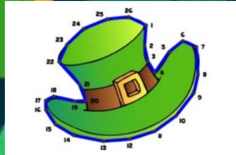
Connect the Dots