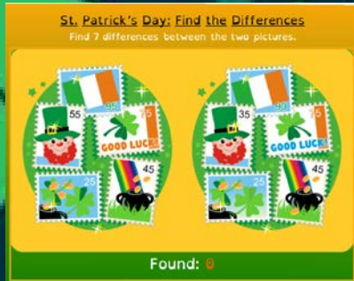
Spot the Difference