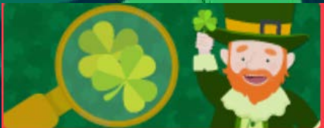
Find the Shamrocks