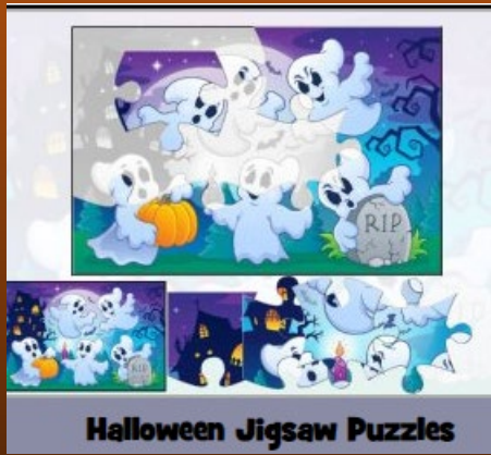
Halloween Jigsaw Puzzles