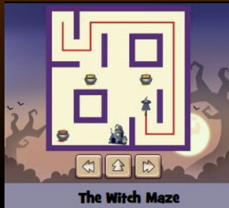
The Witch Maze