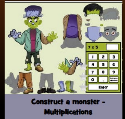
Construct a monster - Multiplications