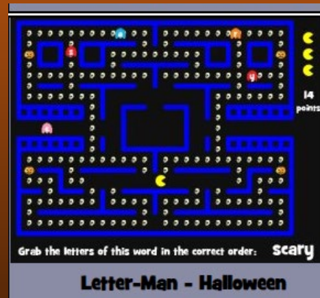
Letter-Man - Halloween