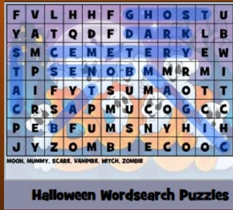
Halloween Wordsearch Puzzles