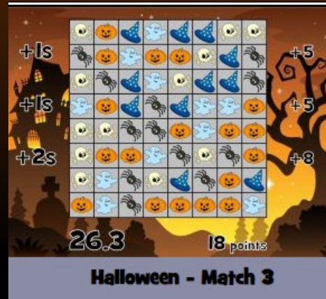
Halloween - Match 3